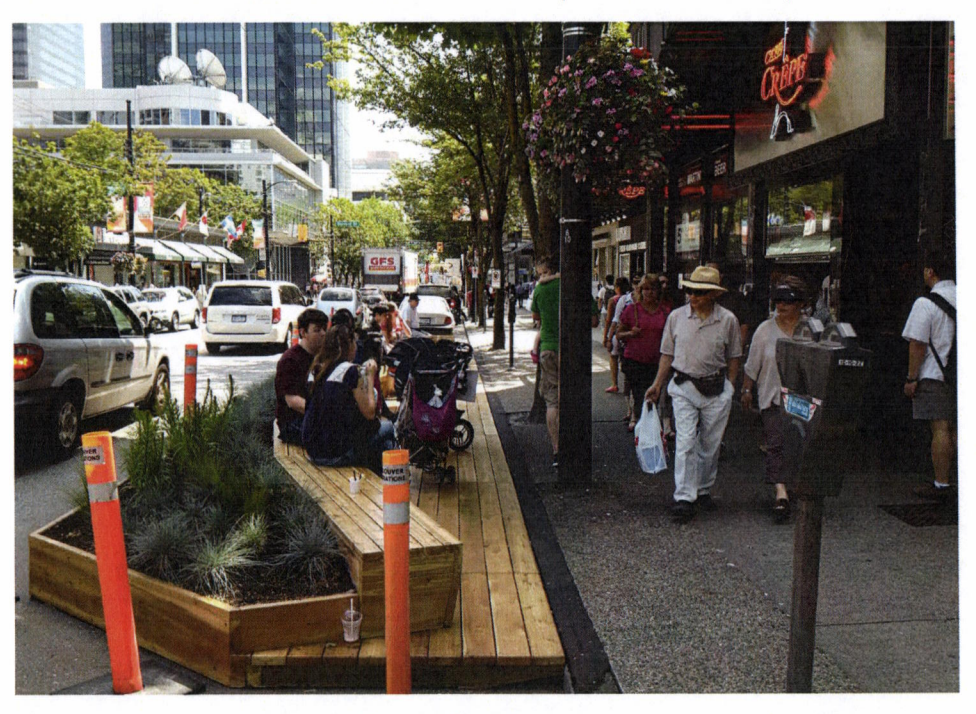
Examples of more permanent improvements